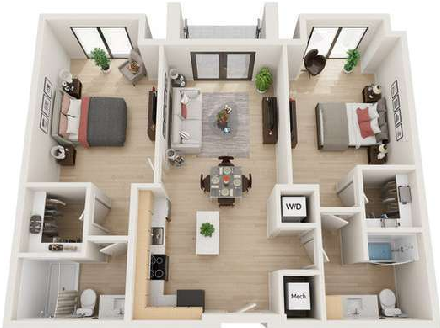
Renderings are an artist's conception and are intended only as a general reference. Features, materials, finishes and layout of subject unit may be different than shown. 3DPlans.com