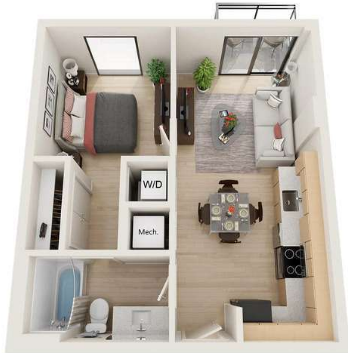
Renderings are an artist's conception and are intended only as a general reference.