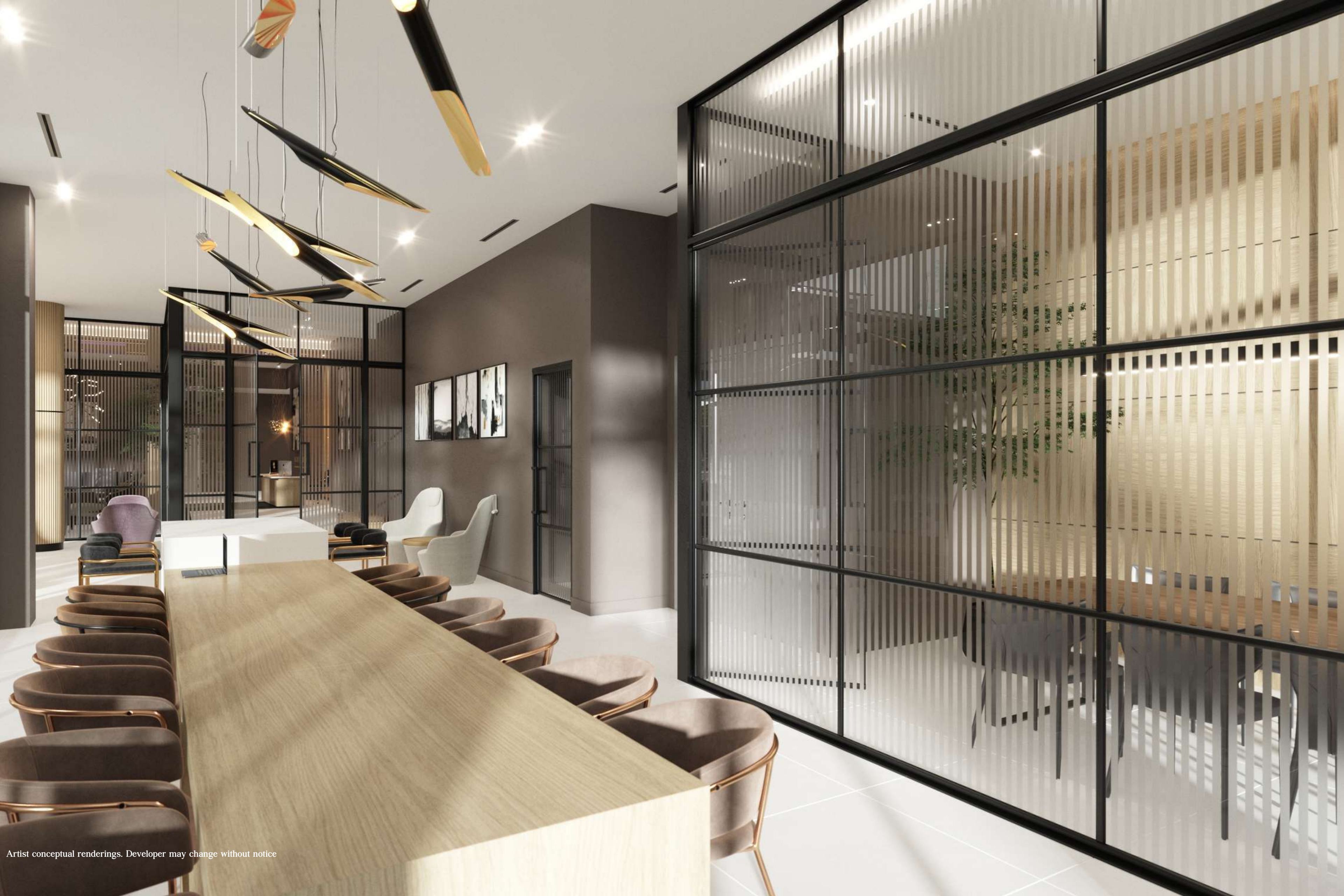
Artist conceptual renderings. Developer may change without notice