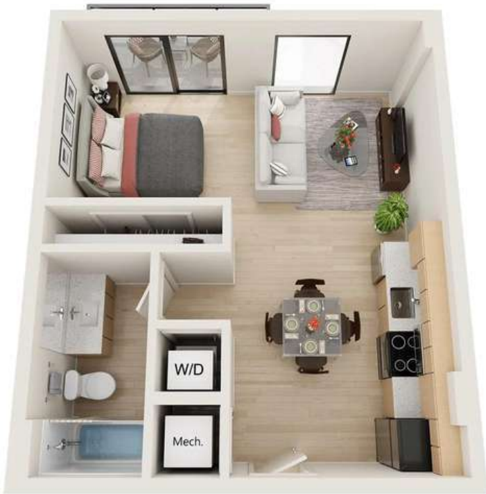
Renderings are an artist's conception and are intended only as a general reference. Features, materials, finishes and layout of subject unit may be different than shown. 3DPlans.com