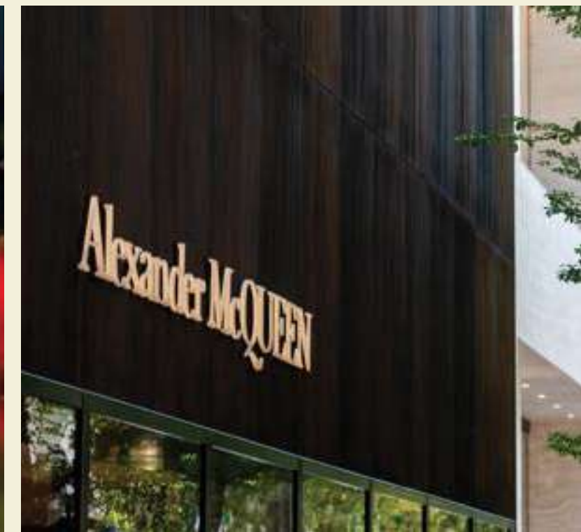
ALEXANDER MCQUEEN, DESIGN DISTRICT