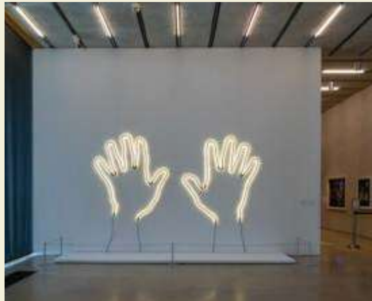
TOP: Wynwood Walls; MIDDLE: Penetrável Macaléia by Hélio Oiticica at Pérez Art Museum Miami; BOTTOM: Notes for a Poem on the Third World, Glenn Ligon, Pérez Art Museum Miami