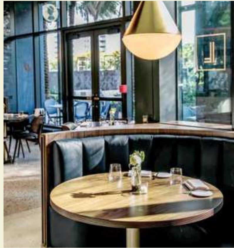
BRASSERIE LAUREL, MIAMI WORLDCENTER

Miami's ever-evolving dining landscape runs the gamut from local spots to acclaimed restaurants, serving cuisines as diverse as the people who flock to the city. Over a dozen Michelin-starred restaurants are within striking distance of JEM. When completed, Miami Worldcenter will be home to over 30 restaurants, including several from world-renowned chefs.