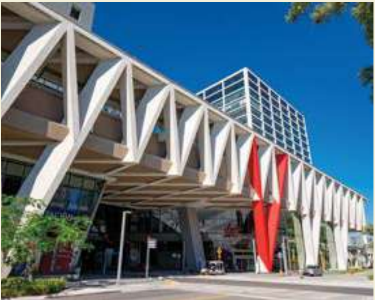
TOP: Miami Metromover; MIDDLE: Brightline; BOTTOM: MiamiCentral Train Station