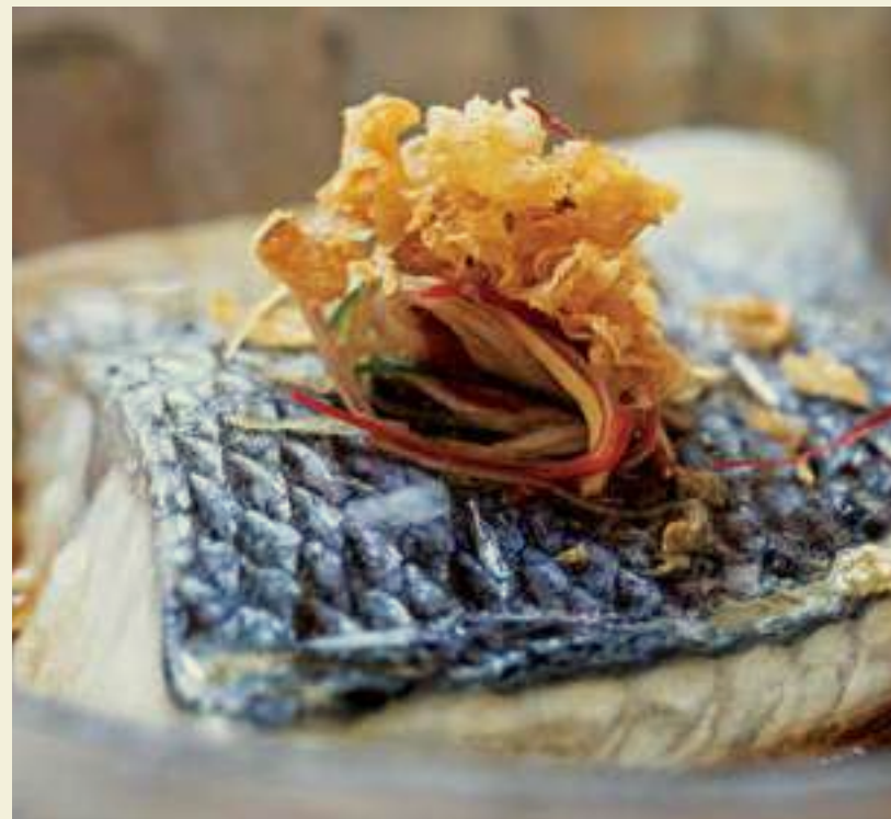
SEXY FISH MIAMI