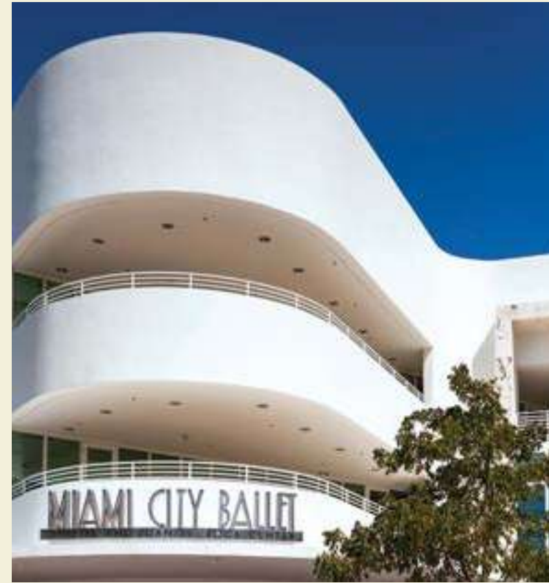
MIAMI CITY BALLET, MIAMI BEACH