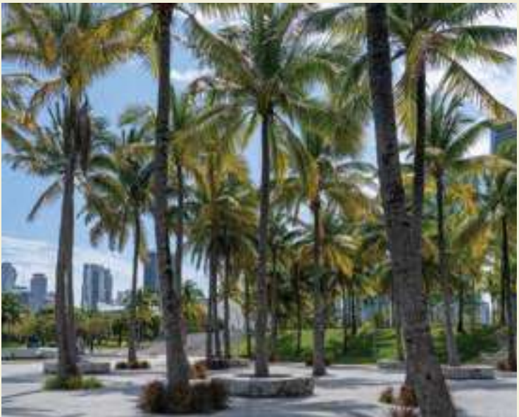
TOP: Miami Beach Golf Club; MIDDLE: South Beach; BOTTOM: Maurice A. Ferré Park Baywalk