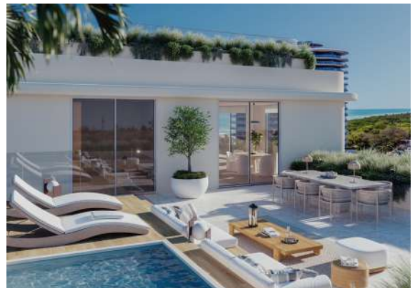
PRIVATE ROOF TOP TERRACE