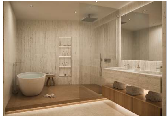
EN SUITE PRIMARY BATHROOM

One-to three-bedroom residences, most with an additional den, offer beautifully crafted interiors featuring chef-inspired kitchens. Thoughtfully designed for both privacy and effortless entertaining, these homes offer a perfect balance of comfort and connection. Residents can enjoy spacious balconies and select rooftop terraces, with optional features such as plunge pools, summer kitchens, and luxury curated furnishings packages by RH.