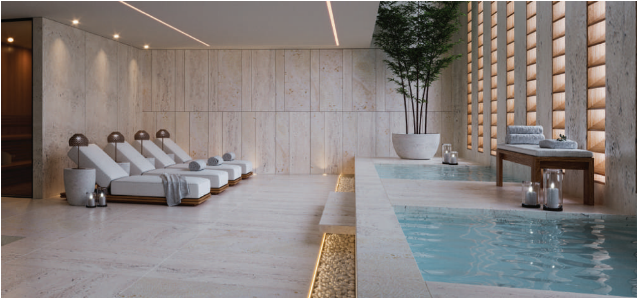
WELLNESS & SPA